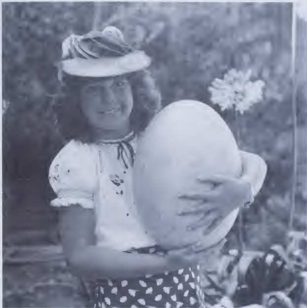
Figure 2 The Scott River egg, found in 1930 near Augusta.

reported in years BP (before present, where present is 1950 AD) and are calculated using the "Libby" half-life of 5568 years and the assumption that the production of ^{14}\text{C} has been constant. The differences between conventional radiocarbon ages and calibrated ages has been determined with high precision for most of the Holocene by radiocarbon measurements on tree ring samples, which are independently dated by dendrochronology. Part of this difference derives from the use of conventional half-life, which is known to be 3% too small. The remaining difference derives from secular variations of ^{14}\text{C} production rate in the atmosphere for geo- and helio-magnetic effects and global variations in the parameters of the carbon cycle.